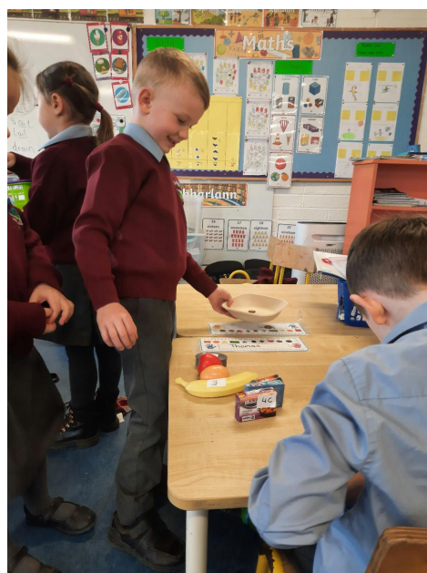
Junior Infants learning about money