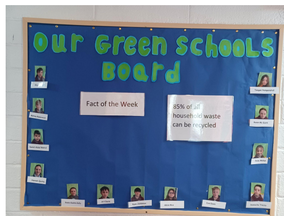
Our Green Schools Committee Notice Board - Fact of the Week

All classes will be taking part in RSE which is part of our Social, Personal and Health Education Curriculum. Letters will be sent home to parents before lessons are taught and parents are encouraged to follow up with their children in relation to what they are learning in class. In 3rd to 6th classes, we follow the Busy Bodies programme. Please see our RSE policy for further details and you can also look at www.healthpromotion.ie/health/inner/busy_bodies